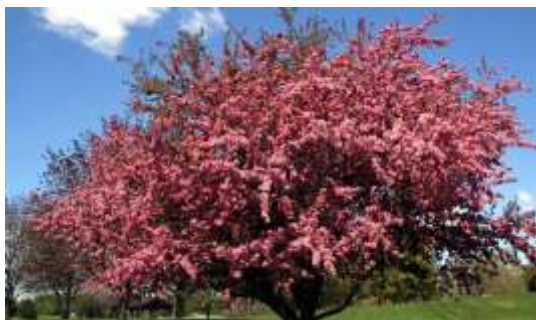
Malus Rudoph Crabapple Tree (Spring)