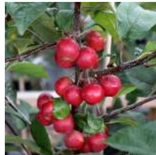
Malus Gorgeous – Crab Apple Tree (Harvest Time)

This is only a very small sample of Crab Apple Trees. They are beautiful and tasty. ENJOY!!!!