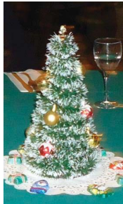
Well done, Louise

The Center Pieces were done by Louise Blackshaw.