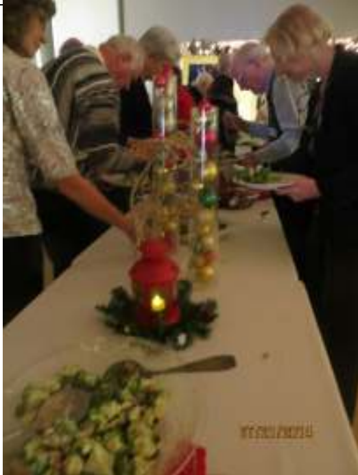
Lining up for the buffet