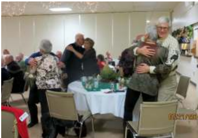
Acting out the 12 Days of Christmas. We think it is ladies dancing?