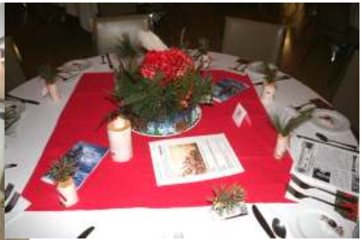
The table is set

December 2nd over 100 members enjoyed a Christmas Luncheon at the Lions Centre. They participated in Christmas trivia, carol singing, and some impromptu acting of the “Twelve Days of Christmas. Of course they enjoyed a sumptuous turkey dinner provided by the Lions staff. Many thanks to the committee who organized such an enjoyable event.