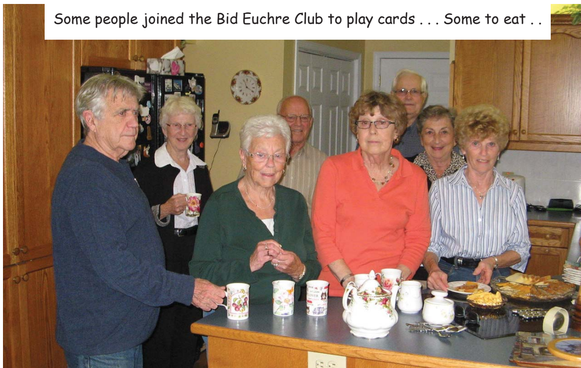
Some people joined the Bid Euchre Club to play cards . . . Some to eat . .

They put his left leg in. And then the trouble started.