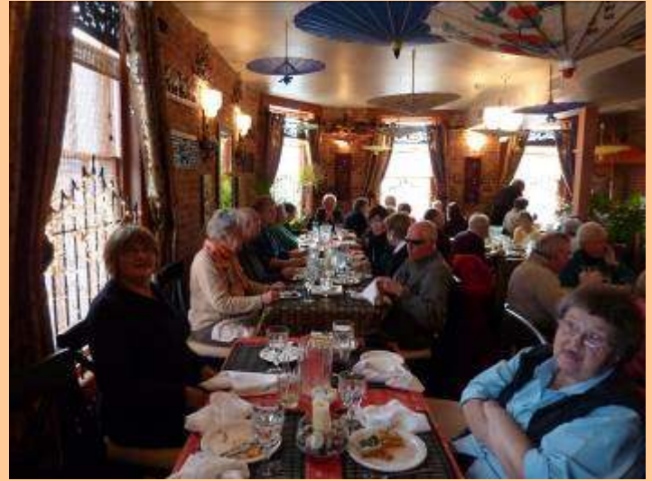
Some of the 48 people who attended the Lunch Bunch!