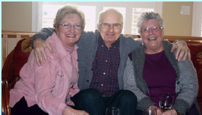
A thorn between two roses!