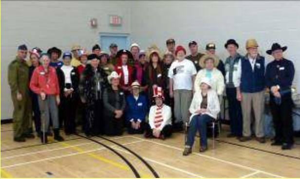
Group picture of members and their 'chapeaux'!