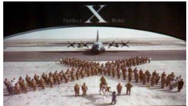
Plane and troops on the tarmac

On October 5, 2010, Tom was notified that the camp was to be closed down within 30 days. By November 1, all negotiations and briefings by the Mission Closure Team were completed, and sea containers were shipped out. There were many concerns about the closure - mission continuity, continued good relations with the UAE, support to the allies, proper disposal of assets, financial accounts and an orderly, respectful departure.