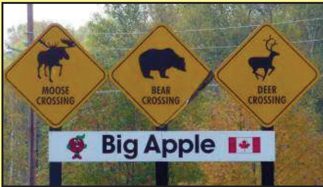
A convenient pit stop along the way