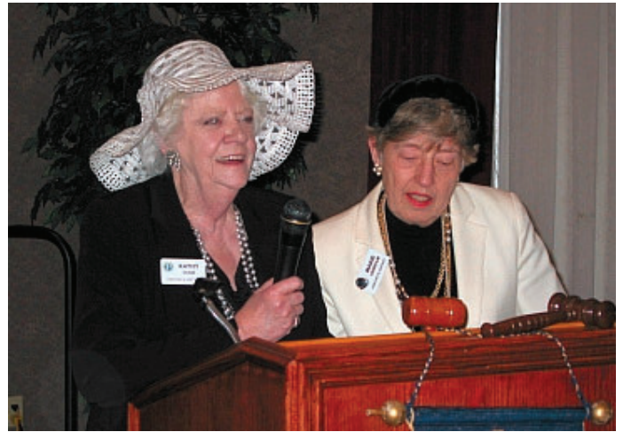
The Golden Girls , dressed to the nines, were on hand to welcome Probian's arriving for their Buffet Breakfast.