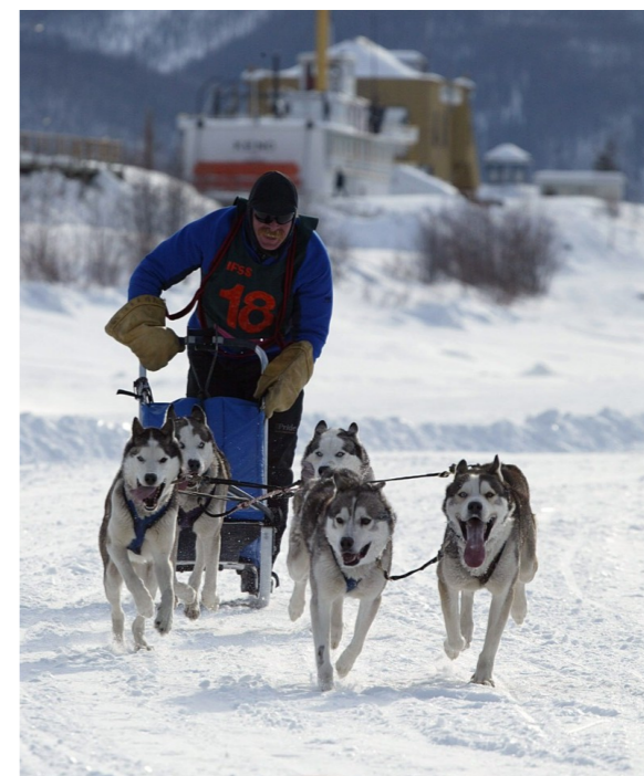
2005 World Championships Dawson City, Yukon, Canada 6 Dog Race

Of course he is very proud of his animals. "Eight dogs in the pure bred class can go 60 miles in 5 1/2 hour...pull a truck out of the mud...one dog pull a quad-runner through the Northumberland forest." He has come to know their intelligence, their ability to learn and then follow to verbal commands, to rely on their instincts, "A good lead dog can feel the hard packed trail."