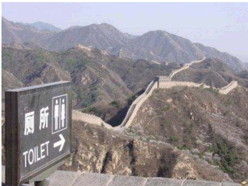
A long walk to the toilet!