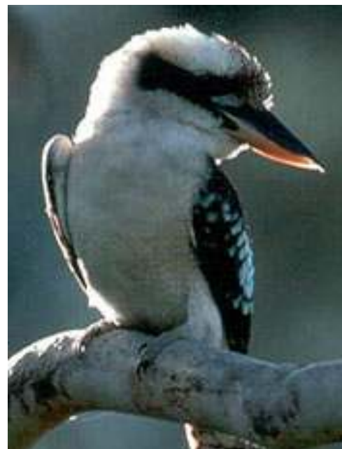
What is this strange bird called?