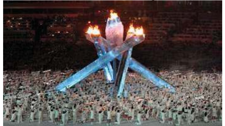
Impressive closing ceremony