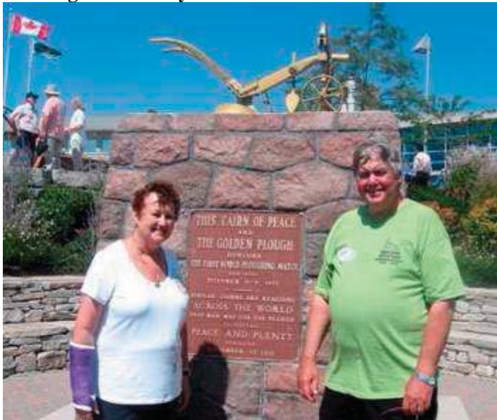
The Cairn of Peace & the Golden Plough monument with the Cobourg Municipal building in the background and the proud couple in the foreground.