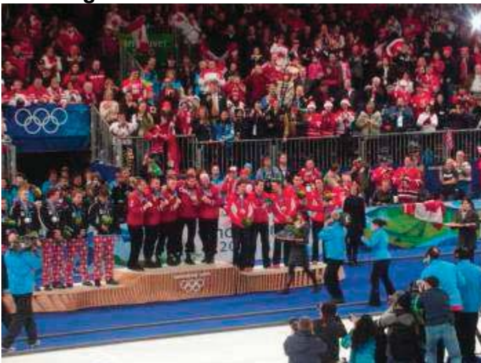
Medal ceremony at the new Curling Rink