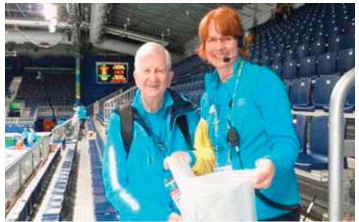
Volunteers at the Curling venue