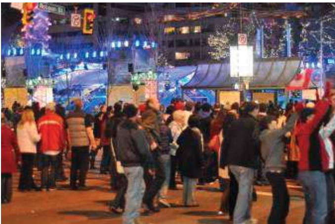
Late night crowds in downtown Vancouver