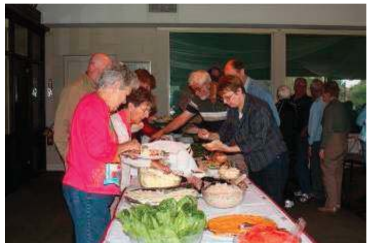
Members helping themselves to various salads: leafy greens, tuna, potato salad, sliced tomatoes and a good choice of cold meats and cheese. The dessert table was filled with an array of tasty squares that satisfied everyone's sweet tooth!