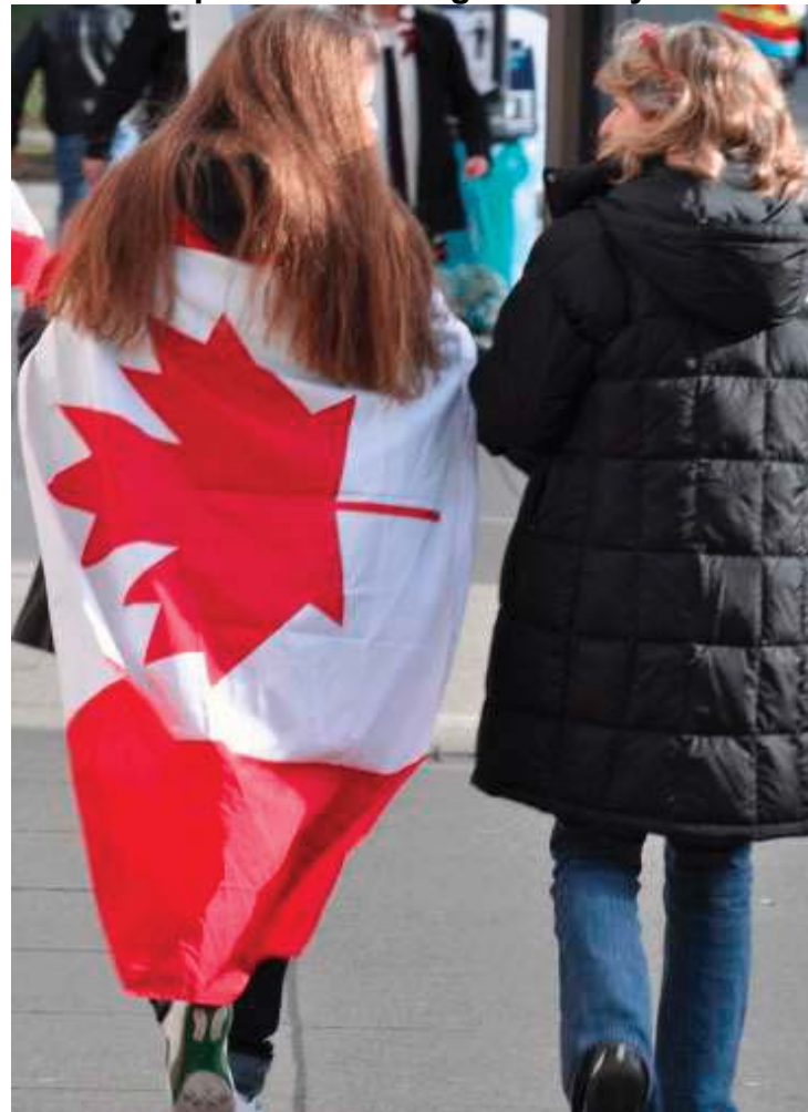
Patriotism is evident everywhere & on everything! Here is a lady wearing our flag...