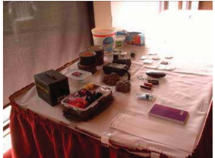
Various caches used in geocaching