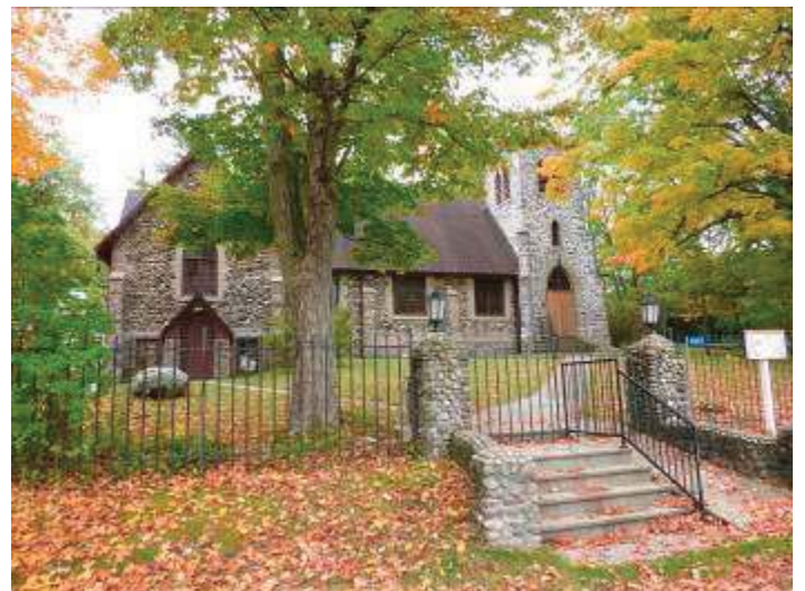
This beautiful little church must have a special meaning for the winners. Ask them about it!