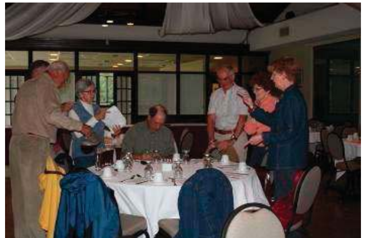
The Winners' Table!! Well done all!