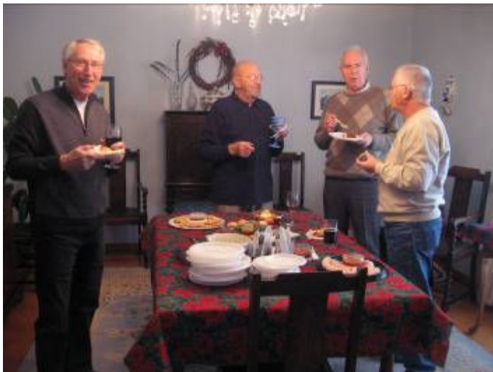
There were lots of great appetizers...