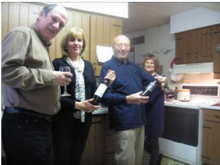
...and plenty to drink as usual.