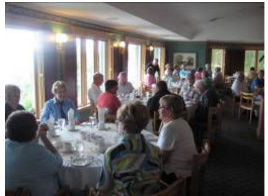
Comfortable and dry at last