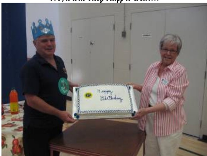
...and two beautiful cakes, enough for all the members...