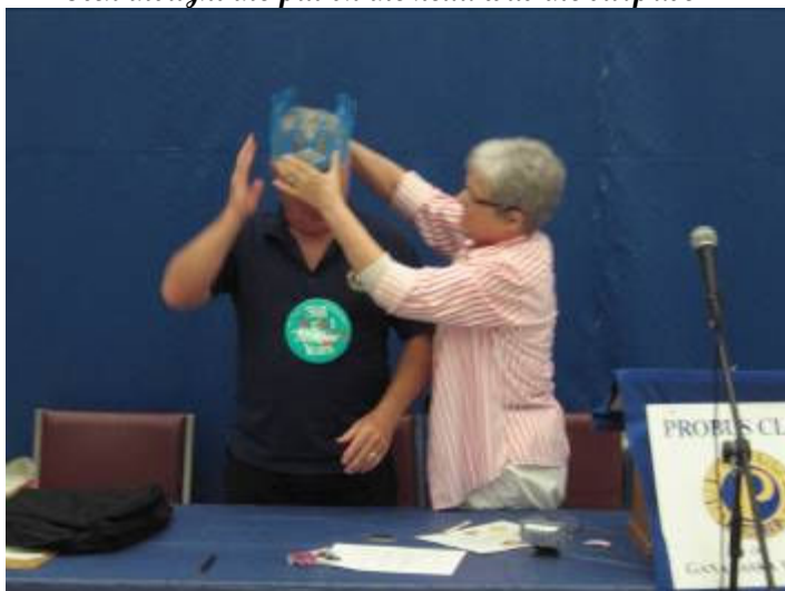
No, it was silly stuff to wear...