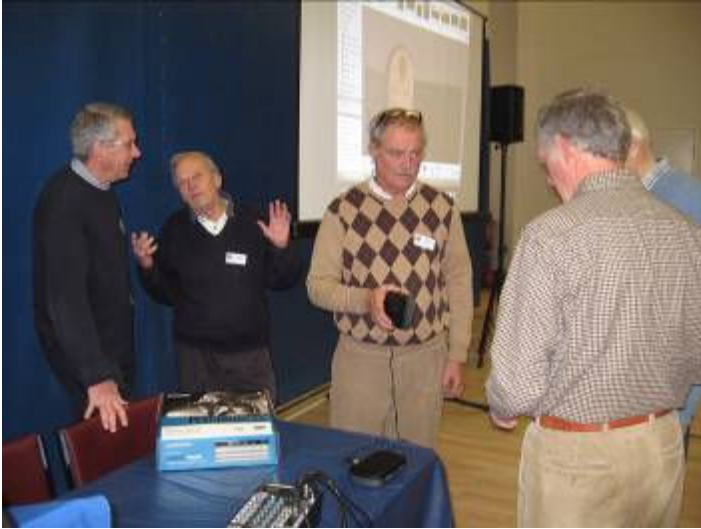
First, they need to have a discussion of the basic principles involved...