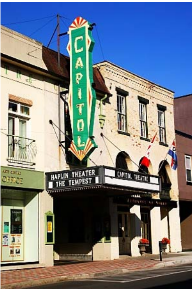
Capitol Theatre Port Hope