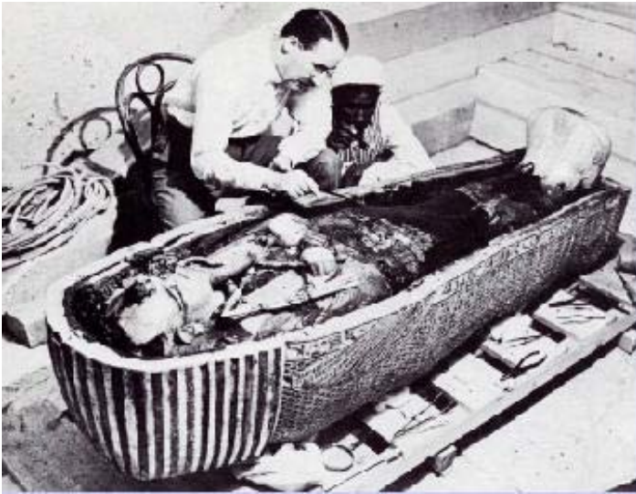
Above. Howard Carter examines Tut's remains

On Sunday, November 26 th , 1922, Howard Carter discovered the Tomb of Tutankamun. King Tut was an insignificant ruler who died young and was soon forgotten by his people. His lack of renown likely helped protect his tomb from grave robbers. The tomb was finally opened in 1922 by Howard Carter in what was to become one of the most important archaeological events of the 20 th Century.