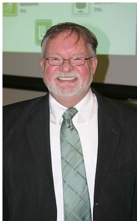
Bruce Craig Lakefront Utilities Systems.