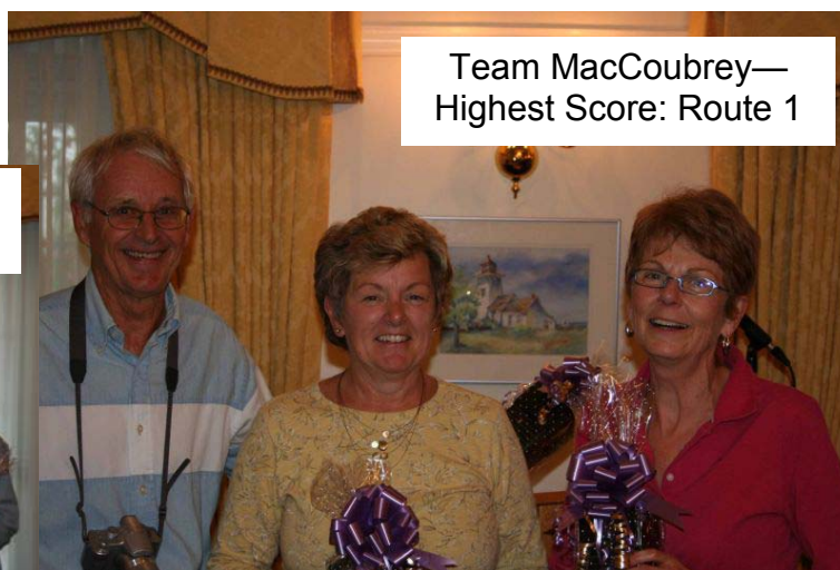
Team MacCoubrey— Highest Score: Route 1