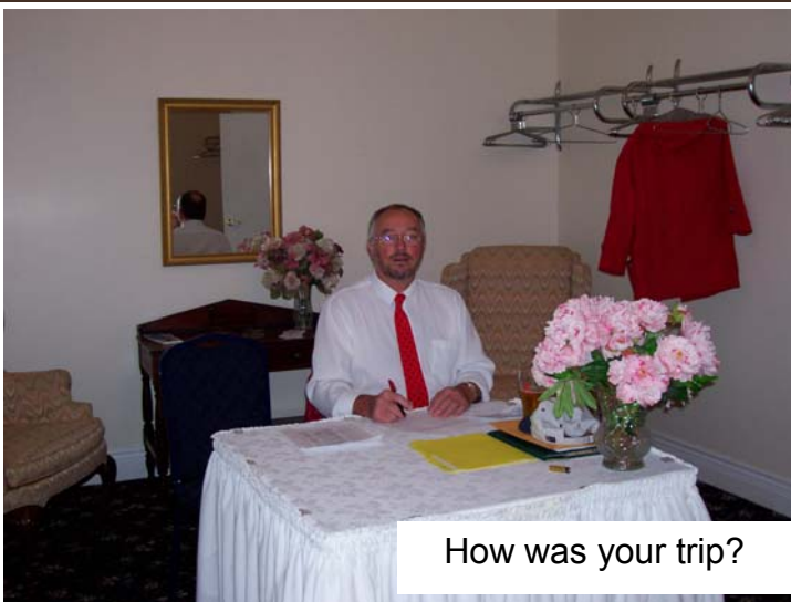
How was your trip?