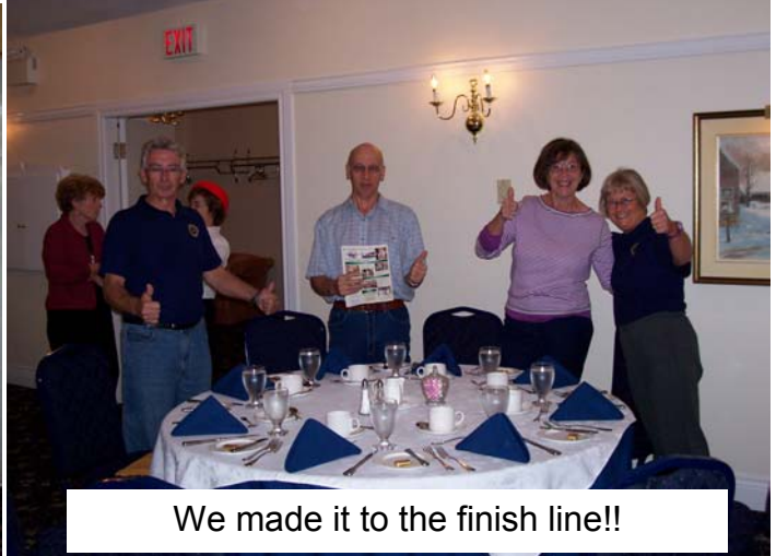
We made it to the finish line!!

The Car Rally committee would like to thank everyone for their enthusiastic participation in the activities of the day