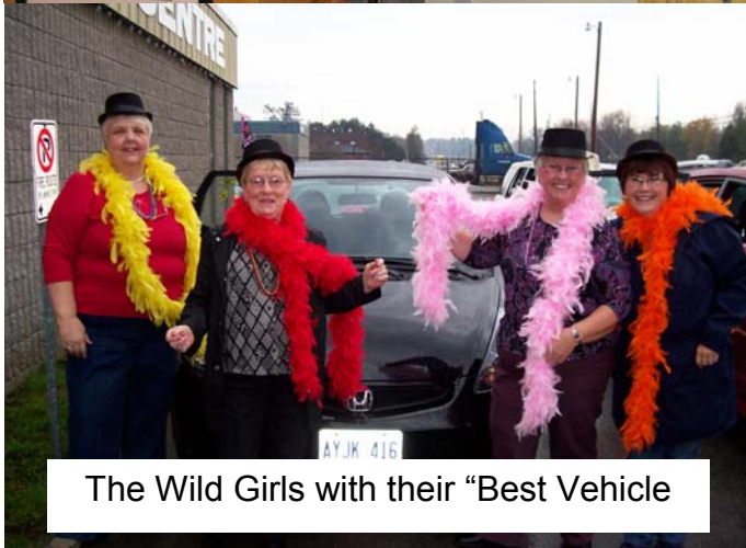
The Wild Girls with their "Best Vehicle"