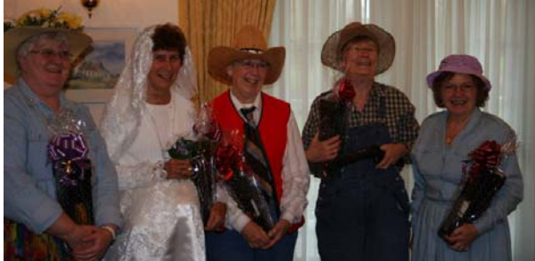
Shotgun wedding: A case of wife or death: Best Costumes