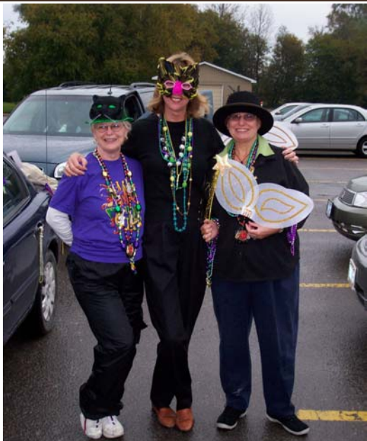
"Mardi Gras" anyone?