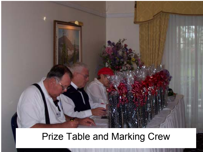
Prize Table and Marking Crew