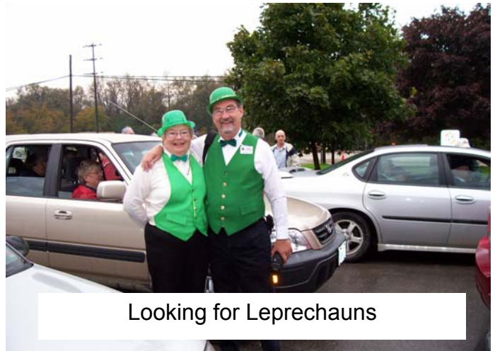
Looking for Leprechauns