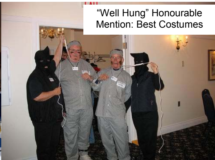
"Well Hung" Honourable Mention: Best Costumes

Thanks to all of you who contributed pictures but limited room necessitated the choosing of only a few. All of the pics can be seen on the www.probusNortumberland.com website.