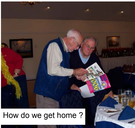
How do we get home ?