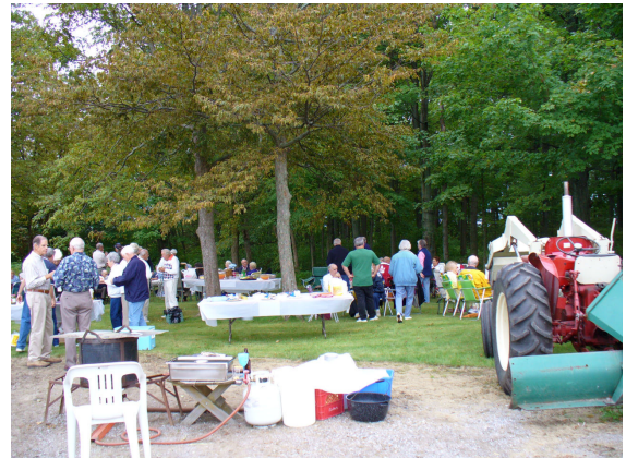
"Chowing down Probus style". Not to imply anyone ate a lot but note Doug's front end loader at the ready to clean up the corn cobs.