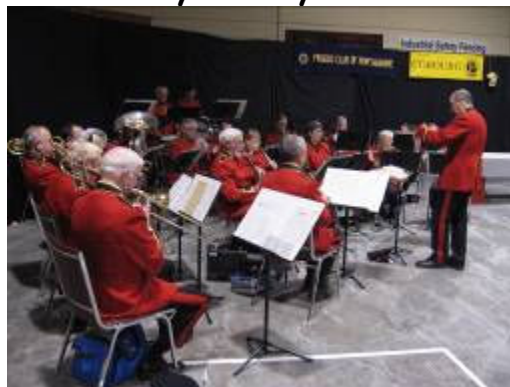
The Cobourg Concert Band