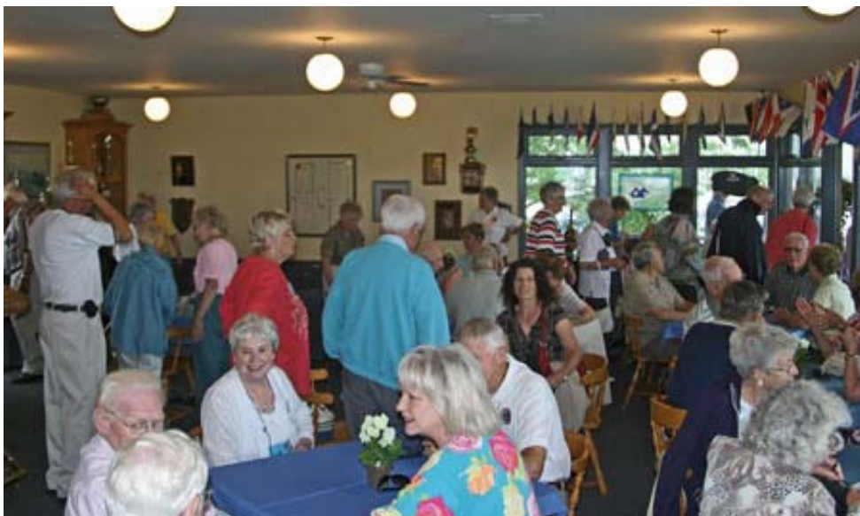
(Right,) part of the large crowd which enjoyed the luncheon and fellowship after the tree dedication ceremony.

The brief shower that fell just after the ceremony could not dampen the warmth and good fellowship experienced by all who attended.